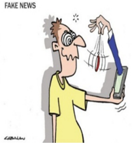
Available at: https://imirante.com/oestadoma/noticias/2016/07/18/charge-cabalau/. Retrieved on: 20 Nov. 2019

In the second editorial cartoon analyzed, image number eight, we have again two semiotic modes acting on the conceptual construction of fake news , the verbal mode and the visual mode. In the verbal mode, the written word fake news activates the target domain, while the visual mode leads us to the activation of the source domain of this multimodal metaphor, that is, a weapon. In this way, the red hands of the characters depicted in the editorial cartoon lead us to associate the hands color with blood, so we can infer that, as a weapon, fake news can seriously damage people. Therefore, people who share this kind of information are left with blood on their hands, in the same way that people who commit crimes, above all, murderers. With these domains activated, we build the metaphor FAKE NEWS IS A WEAPON.